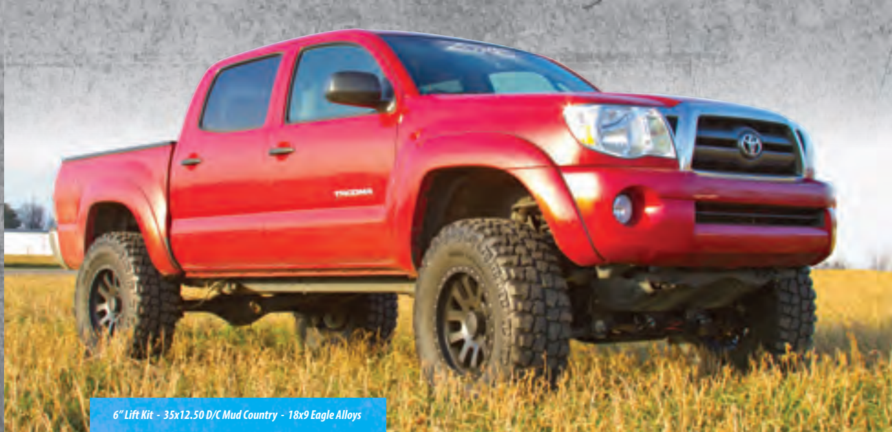
6" Lift Kit - 35x12.50 D/C Mud Country - 18x9 Eagle Alloys