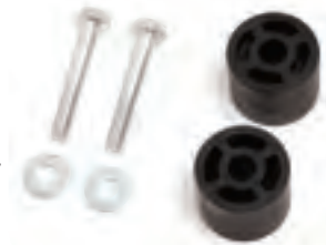
T5409 - Carrier Bearing Drop Kit