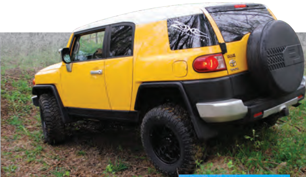
2.5" Lift Kit - 285/75r16 M/T MTZ - 16" M/T Sidebiter