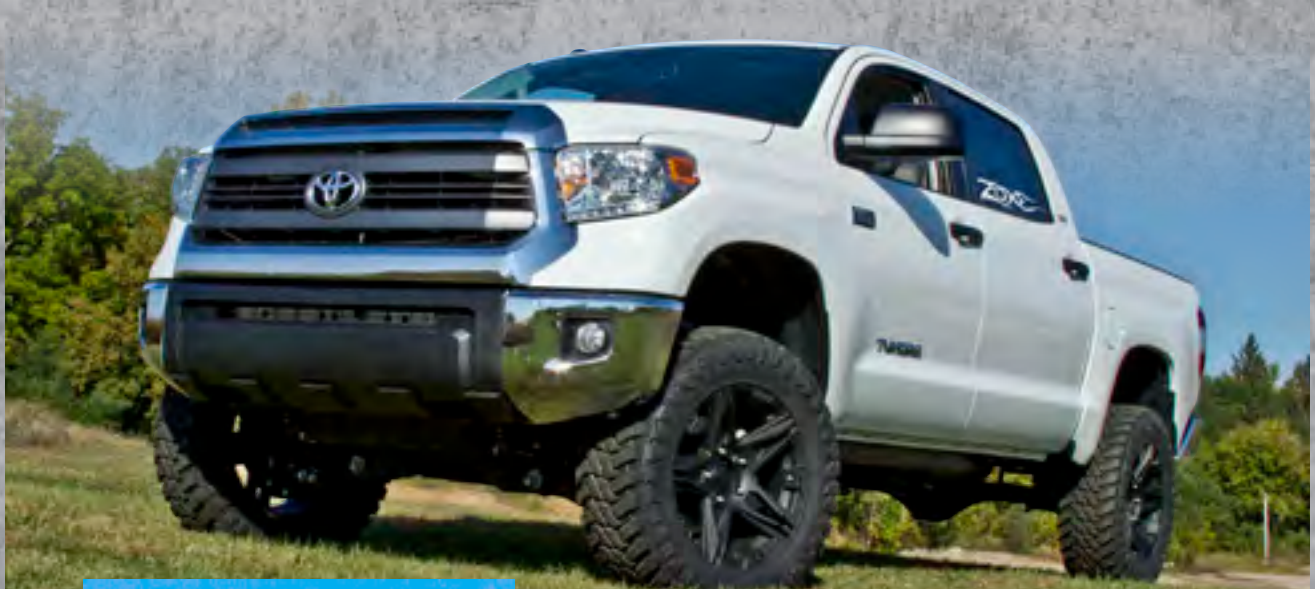
5" Lift Kit - 35x12.50 Atturo M/T - 20x9 American Outlaws