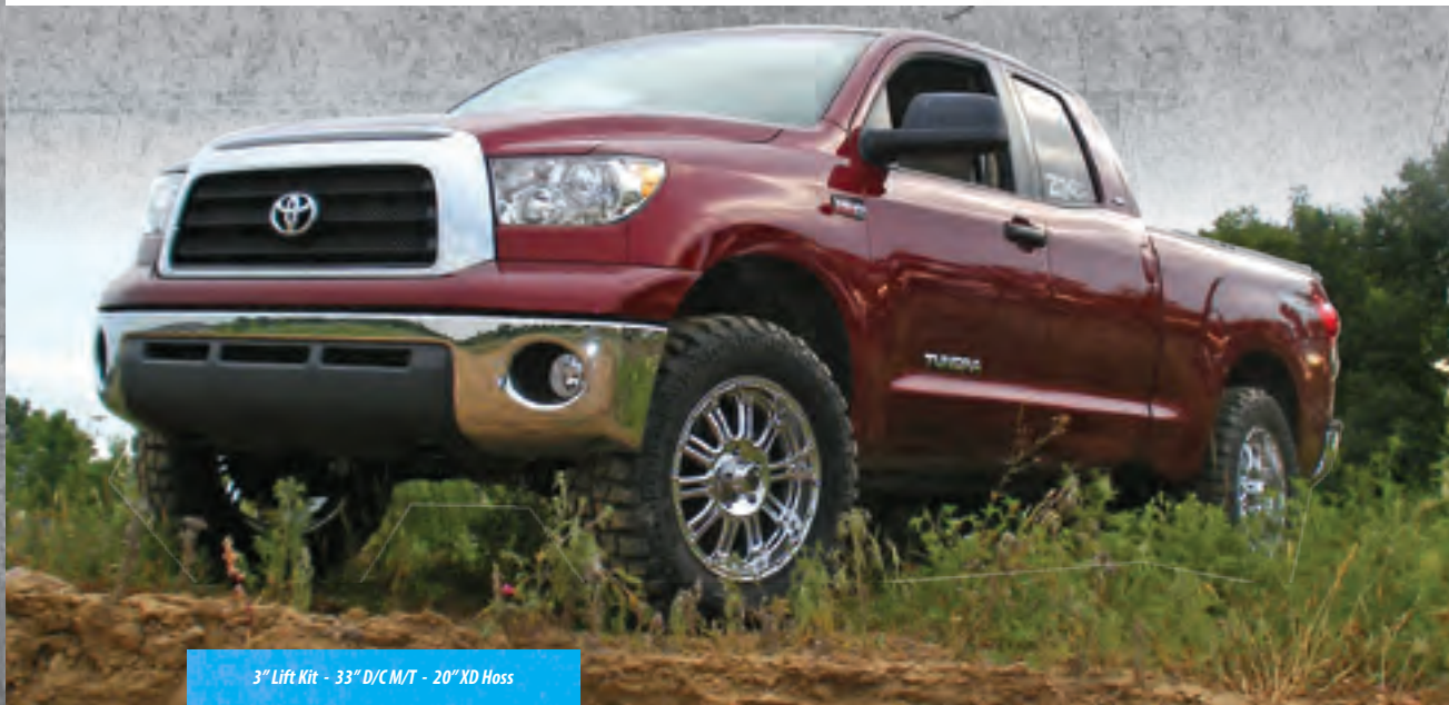
3" Lift Kit - 33" D/C/M/T - 20" XD Hoss